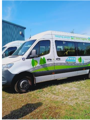
A community all electric minibus