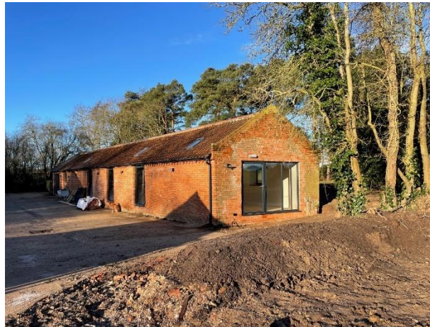
Updating an unused agricultural building to a Wellness centre. The space is divided to enable a range of complementary businesses to come together