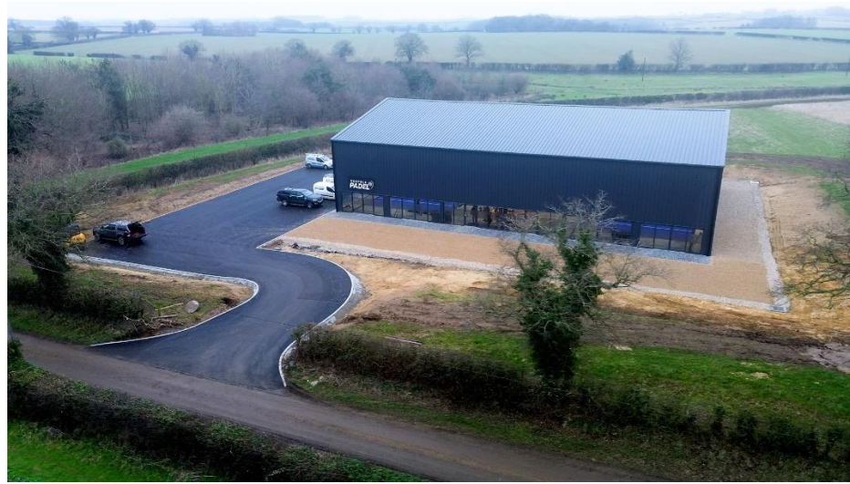
New sport facility in a rural farm diversification project