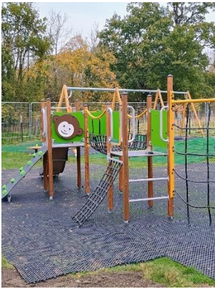
A community place space for rurally isolated families