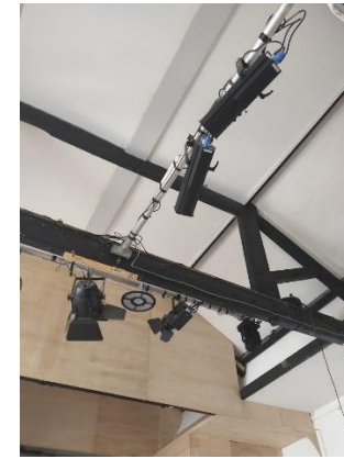
Improvements as part of a local town centre theatre space