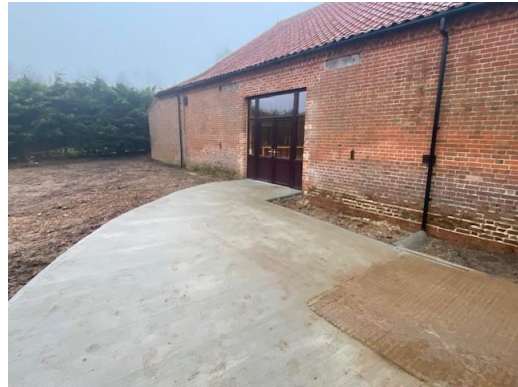
Redundant farm building to a tap room and tasting area with retail options, business space and storage