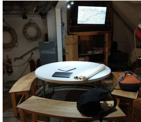
A space for 'mardling' and workshops within a local museum