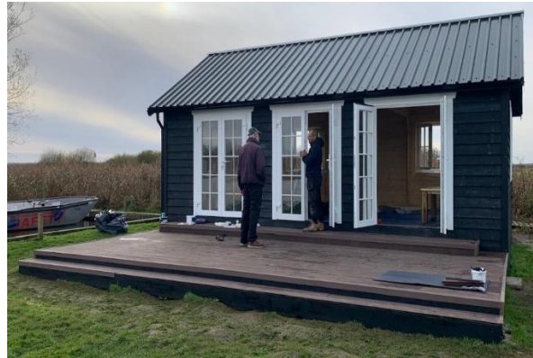
Clubhouse on a piece of riverbank, to support membership, fundraising opportunities and increased community cohesion